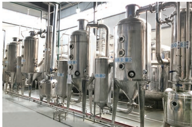
Condensation tanks remove as much as 95% of solvents (water and alcohol) used during the extraction stage. This is a critical stage to ensure the finished product is as strong as possible.

Alcohol is a semi-polar solvent. Compounds with low polarity are more soluble in alcohol - this includes free alkaloids, saponins and essential oils. Reishi's triterpenes , Ginseng's ginsenosides ,