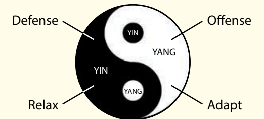
Defense and Offense, Relax and Adapt

Tao is the Chinese term for the infinite-absolute order of the universe. Tao cannot be defined in words, but must be experienced. Tao is the harmonious true state of nature, governed by the laws of yin and yang. When a person has discovered the true nature of Tao, they become peaceful, yet alert, seeing all things from all sides, and thus being able to rise above the right and wrong.