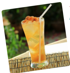
Longan Iced Tea

*Due to no preservatives being used, our Longan's color will darken over time. This does not impact quality or taste.